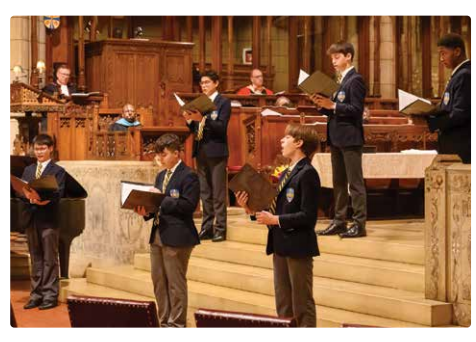
The graduates perform Palestrina's Sicut Cervus

to collaborate. These are skills that are universally useful and applicable. Whatever your future engagement with music, I know these skills will be of great benefit. Congratulations, class of 2023, and may your music long resound.