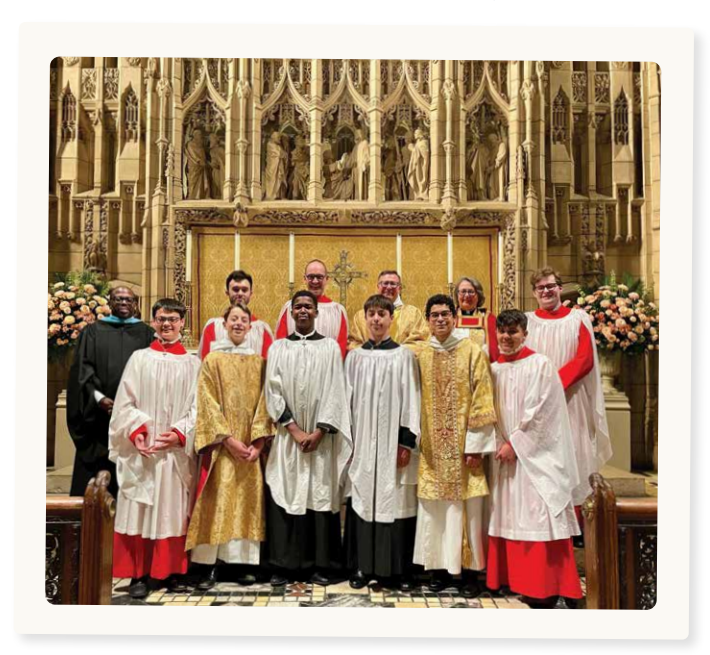
After the valedictory Eucharist service, Sunday, June 11