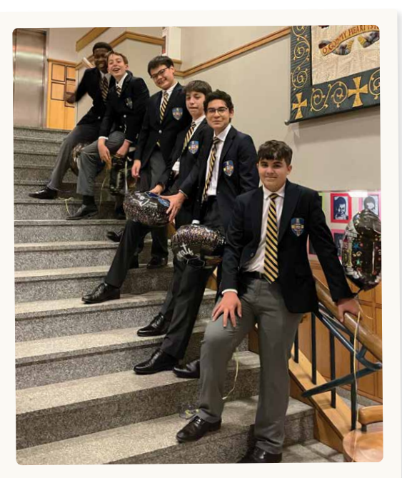
A final photo op with the graduating class.