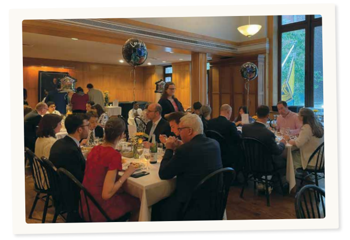
Graduates and their families joined with faculty and staff for a celebratory dinnerat the school.