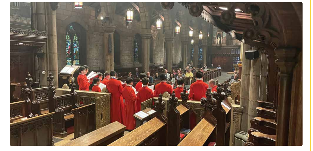
Boys from the choir school had the opportunity to present a short recital after Evensong.

As some may require a purchased ticket (yes, even of parents and alumni), please check for information regarding tickets and parking.