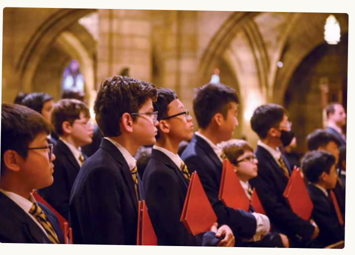
Grades 3-7 attend the ceremonies.