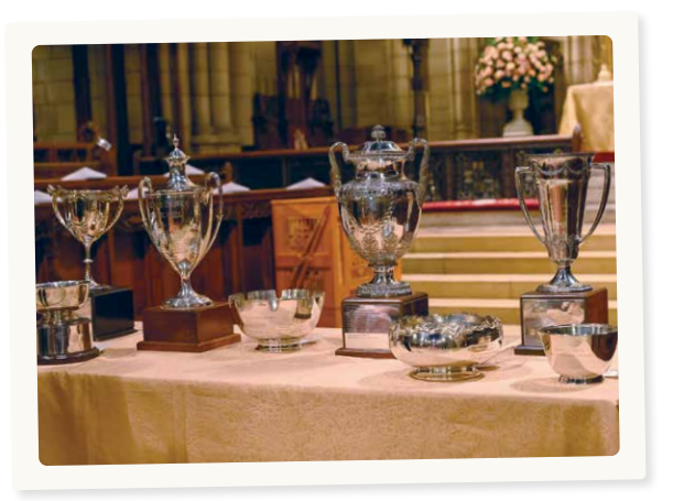
The trophies await the 104th commencement exercises.